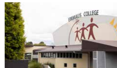
Jimboomba Central Shopping Centre & Emmaus College

A place where you can enjoy a quiet, family-oriented lifestyle embedded within tranquil surroundings.