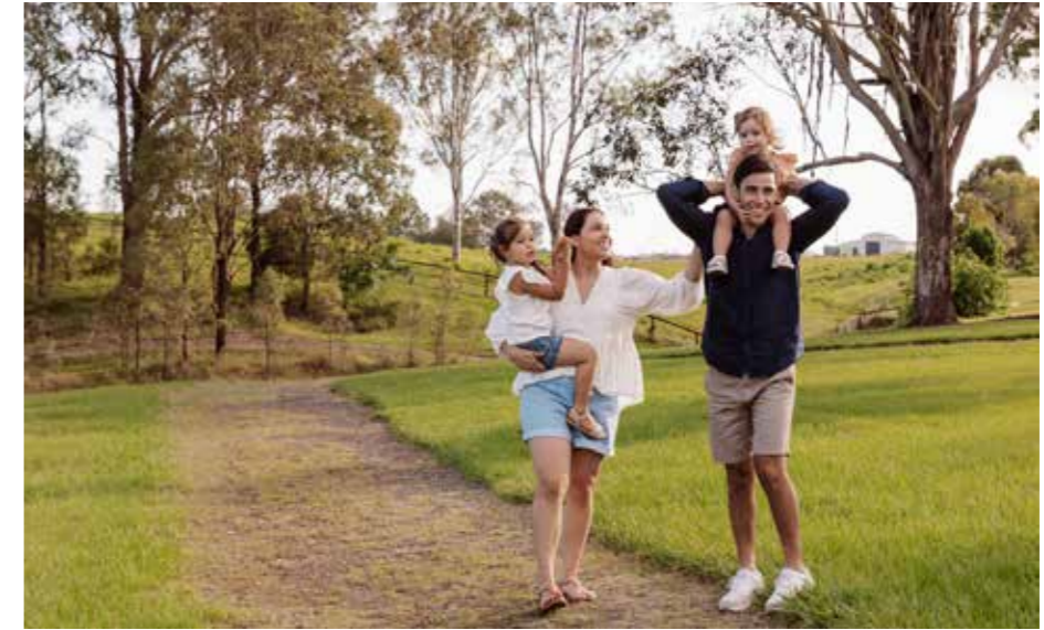
Glenlogan Lakes Park