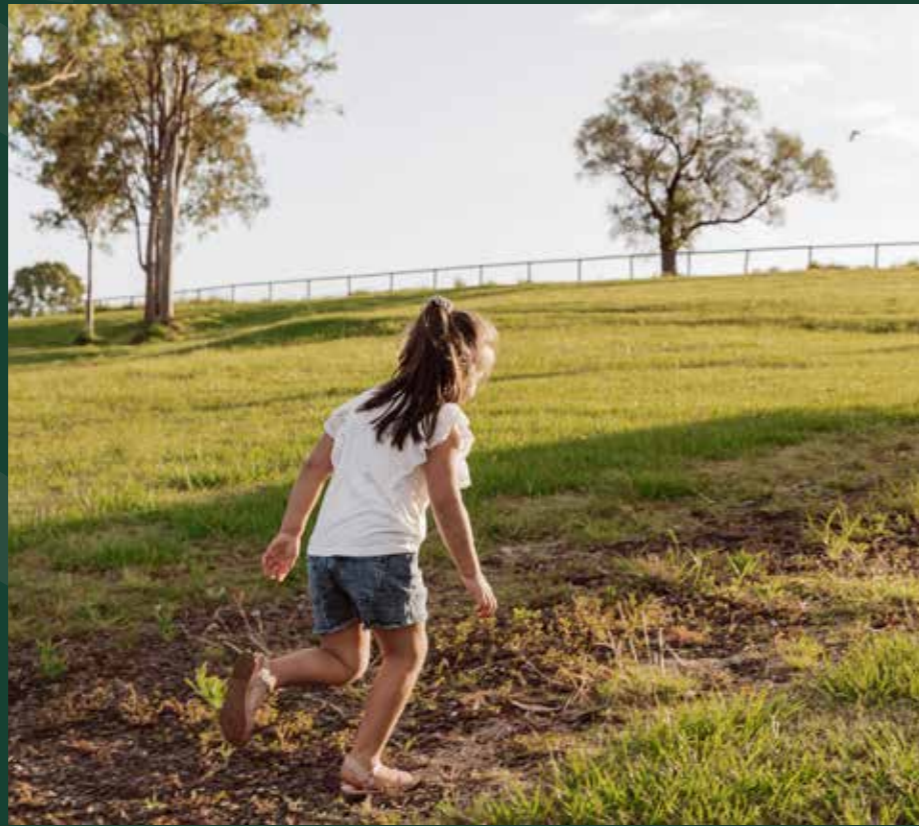
Glenlogan Lakes Park