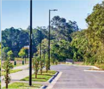
Dakota - Burpengary East, Qld

At KDL Property Group, people come first. We are driven by an aim to enrich the lives of every resident and partner in our communities. This has led us to create safe, rewarding, quality places for people to call home.