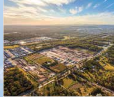
Nevada - Park Ridge, Qld