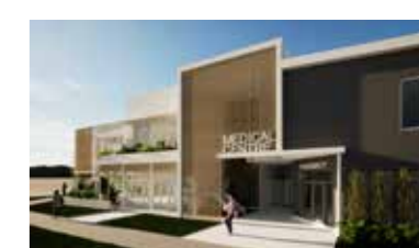
Allied Health Precinct