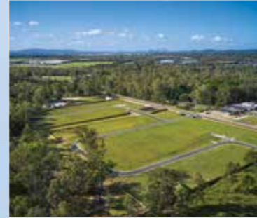
Hampton - Pallara, Qld